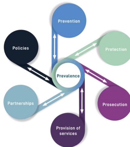
Figure 1: The 7P model

Prevalence refers to data (and data collection) estimating the extent of the gender-based violence and providing information on different forms of gender-based violence. In terms of research performing organisations, this includes prevalence of type of gender-based violence for victim/survivors by different social positions and groupings. Such groupings include those categorised by social divisions, notably age, class, (dis)ability, ethnicity/racialisation, sex, gender, sexuality, and also those categorised by functional position in the research performing organisations in question: students, academics, and professional, administrative, technical or other support staff. These include further sub-positions, e.g., undergraduate student, master's student, doctoral researcher, visiting student, visiting (post)doctoral researcher, postdoctoral researcher, lecturer, senior lecturer, assistant professor, associate professor, professor, professor emeritus/a, leader/head of studies/discipline/unit/division/department, dean/rectorate, administrative employer, administrative supervisor/manager, support worker (e.g., laboratory technicians, IT, cleaning, catering). Prevalence is also categorisable in terms of the social position of perpetrators (either individual or collective ) and bystanders , and the relationality (in the broadest sense between perpetrators and victims, and by severity and frequency over time).